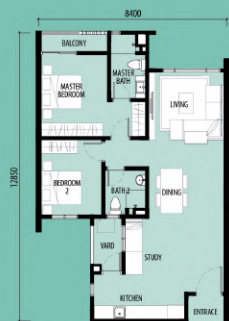
TYPE - A (2 BEDROOMS + 1 STUDY) Built-up: 1000 sq ft