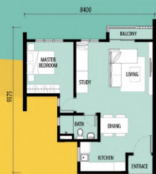
TYPE - A1 (1 BEDROOM + 1 STUDY) Built-up: 650 sq ft