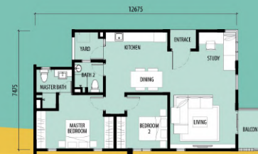
TYPE - C1 (2 BEDROOMS + 1 STUDY) Built-up: 1000 sq ft