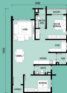
TYPE - B (2 BEDROOMS + 1 STUDY) Built-up: 1000 sq ft