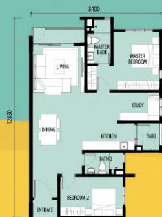
TYPE - B2 (2 BEDROOMS + 1 STUDY) Built-up: 1000 sq ft