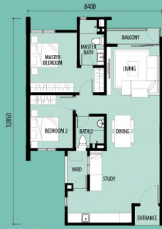
TYPE - A2 (2 BEDROOMS + 1 STUDY) Built-up: 1000 sq ft