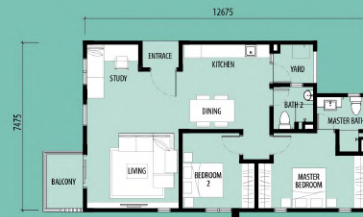
TYPE - C (2 BEDROOMS + 1 STUDY) Built-up: 1000 sq ft